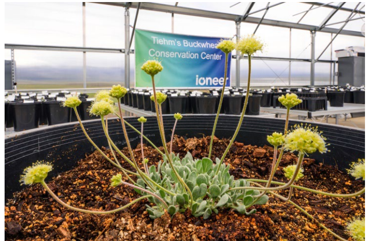
Tiehm's buckwheat at Ioneer's Conservation Center, May 2023.

Ioneer first instituted strict protective measures when we began exploration in 2016. Prior to the federal designation, Ioneer invested $1.5 million in Tiehm’s buckwheat conservation. To date, Ioneer has developed and implemented a BLM-approved protection plan and spent more than $2.5 million in voluntary measures to ensure the plant and its habitat are protected. Additionally, Ioneer has budgeted